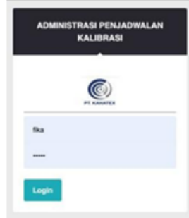
Figure 7. Login page