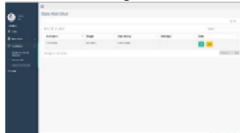
Figure 9. Measuring Instrument Data Report