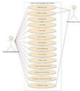
Figure 2. Usecase Diagram