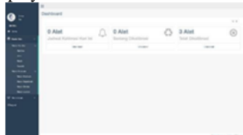
Figure 8. Dashboard/Main Page