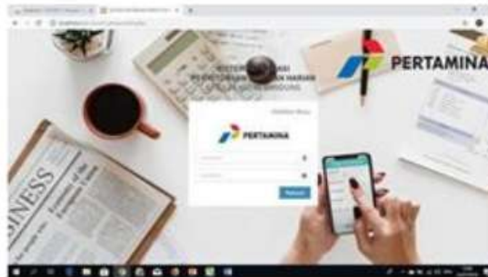
Figure 3. Login page display