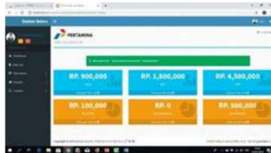
Figure 4. Home Page/Dashboard Display